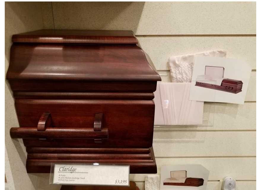
Claridge – Poplar: $3195