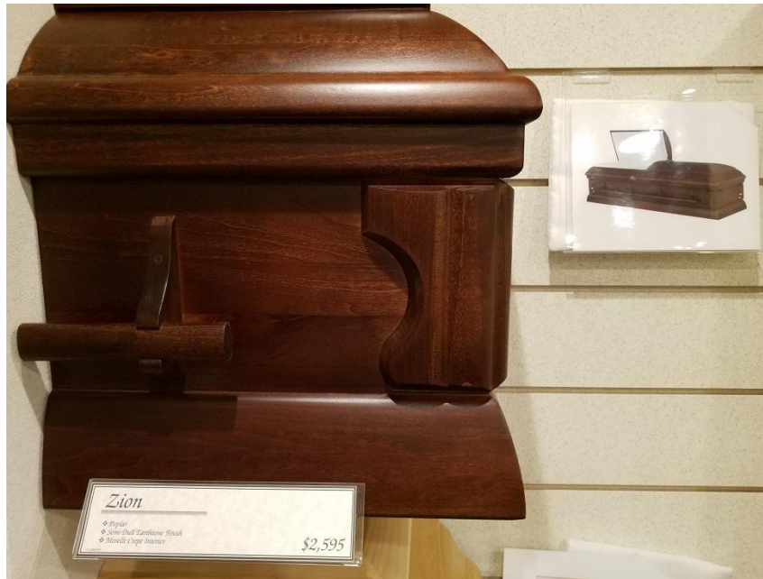
Zion – Poplar: $2595